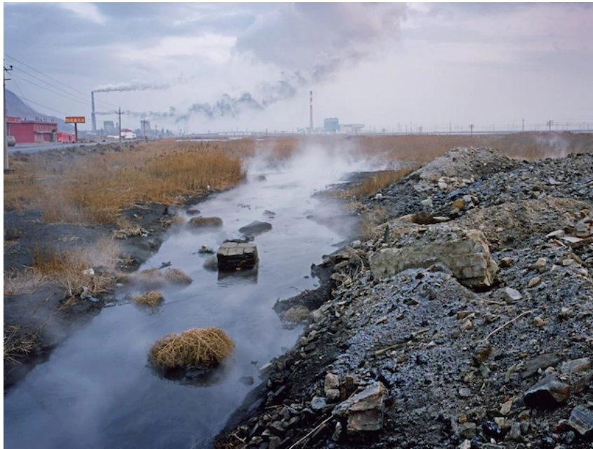
Discharge from a Chinese fertilizer factory winds its way toward the Yellow River. Like many of the world's rivers, pollution remains an ongoing problem.