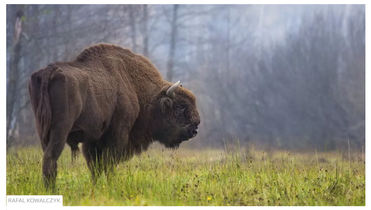
The European bison was driven to the edge of extinction in the early twentieth century by hunting and habitat loss

By Helen Briggs BBC Environment correspondent