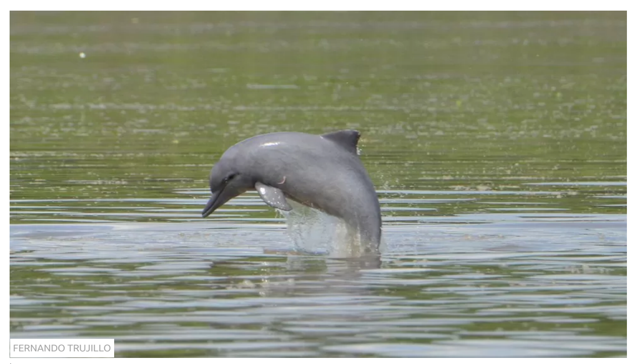
The tucuxi dolphin found in the Amazon river is endangered

A dolphin found in the Amazon river, the tucuxi, has been classed as endangered. All the world's freshwater dolphins are now threatened.