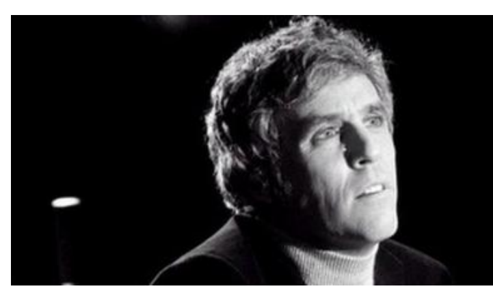
Burt Bacharach: Songs that transcended their era