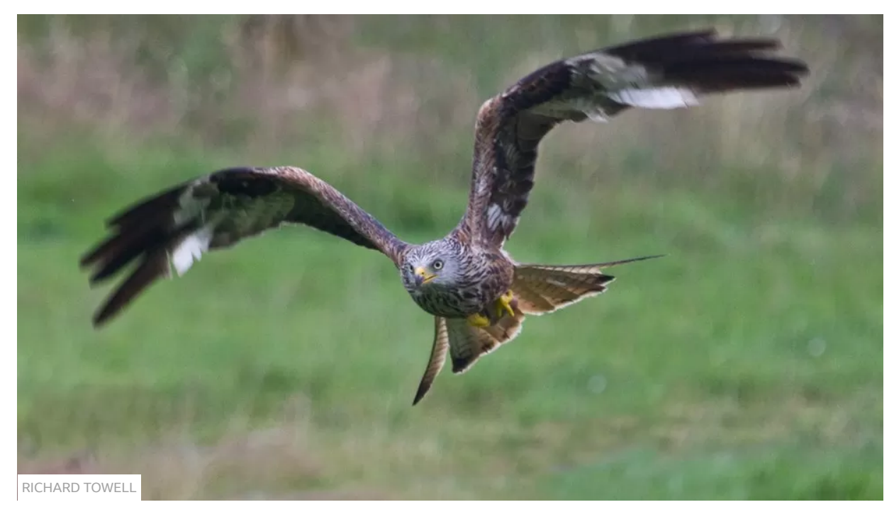
The red kite is increasing in number

Status: Moved from near threatened to least concern (the lowest category of extinction risk)