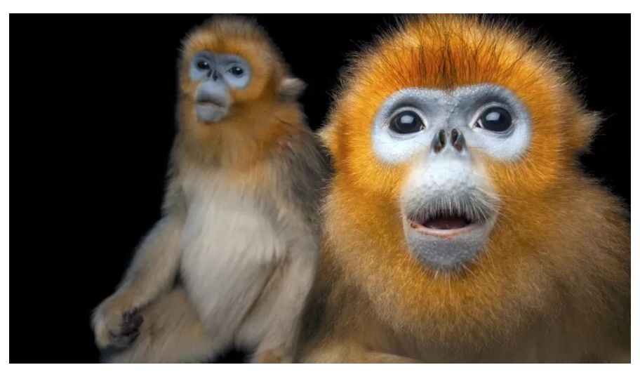
Extinction crisis: Leaders say it is time to act 30 September 2020