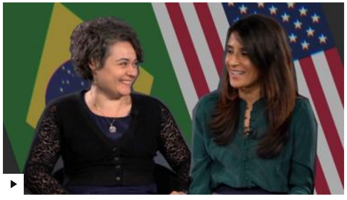
Biden and Lula have more in common than you think