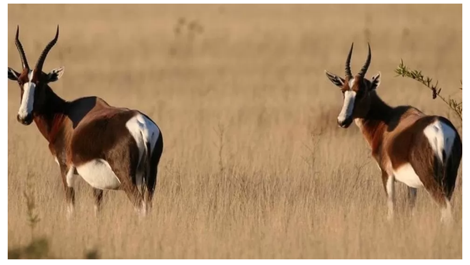
Extinction 'existential threat to civilisation' 2 June 2020