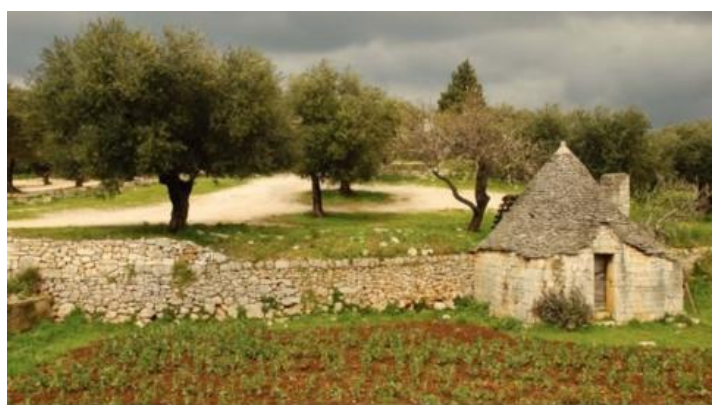
Italy's ancient homes for dodging taxes