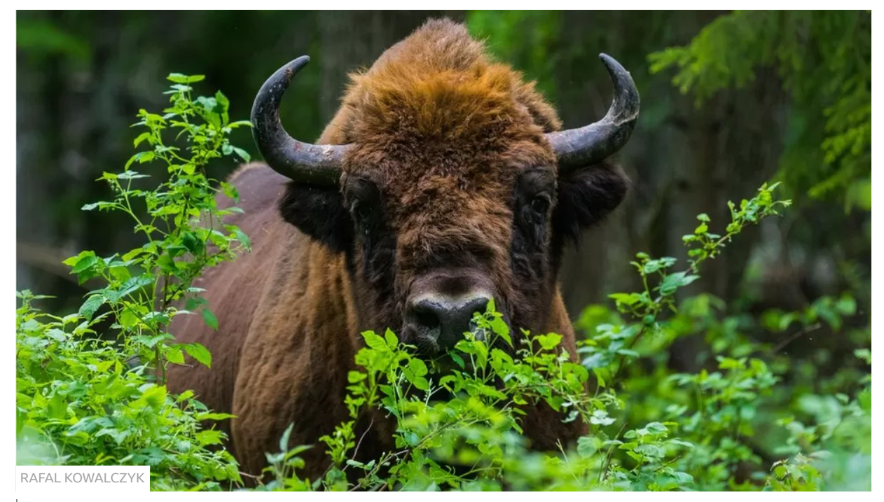
By the end of the 1920s, less than 60 individual European bisons were alive in zoo and private parks

Large herds of wild bison once roamed across Europe, as recorded in ancient cave paintings. But human pressures and hunting caused their downfall, and by the 1920s, the large mammal was extinct, except in zoos.