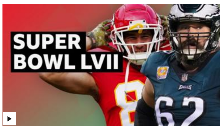
Sibling rivalry & coaches reunited at Super Bowl