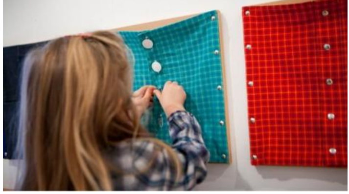
The world's most influential school?